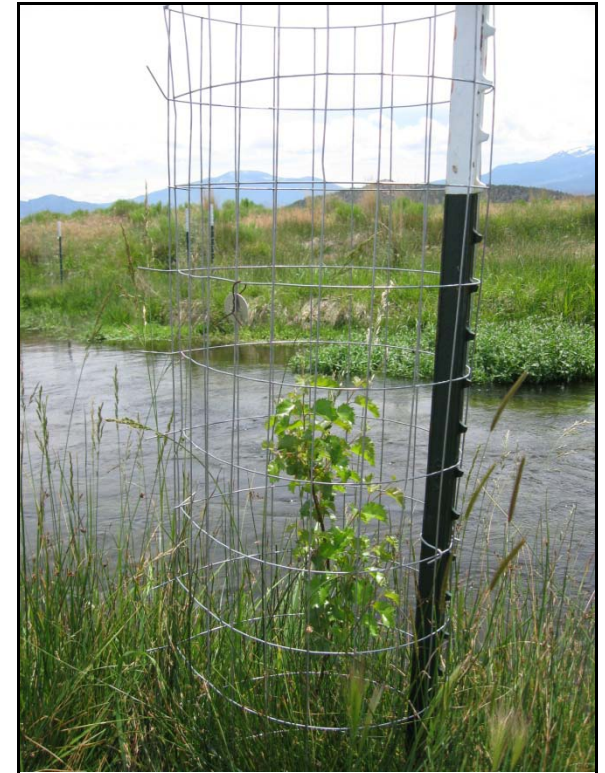
Water birch planted along the Shasta River from a potted plant and caged for protection.

Created by The Shasta River Riparian Working Group