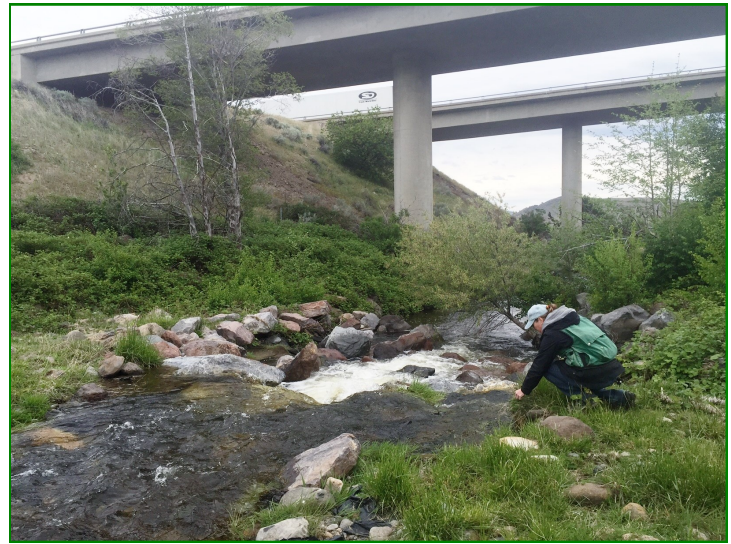
Above: Sheri Hagwood, USFWS conducting a botany survey at the Parks Creek I-5 Bridge.

amples of landowners, agencies and the SVRCD coming together to implement projects that benefit the watershed as a whole.