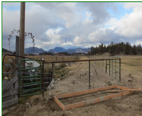
Above: Stockwater under construction

fence, 7000' of barbed wire fence, 4 new water troughs, and 800' of willow plantings. RCD staff have also been seen repairing and removing beaver exclusion cages from trees on over 4000' of healthy riparian habitat. The RCD continues to rely on willing partnerships with landowners throughout the Shasta River watershed who are keen to improve riparian and in-stream habitat with projects which also improve efficiencies and infrastructure on their land. For more information, or if you have a potential project on your property, please contact RCD staff.